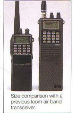
Size comparison with a previous Icom air band transceiver.

Ergonomic keypad design provides convenient access to all functions and a rotary control allows quick tuning of channels.